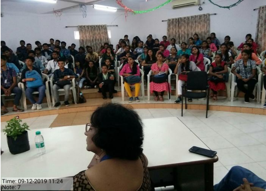
Time: 09-12-2019 11:24 Note: 7