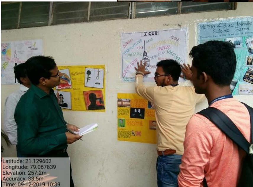
Latitude: 21.129602 Longitude: 79.067839 Elevation: 257.2m Accuracy: 33.5m Time: 09-12-2019 10:39